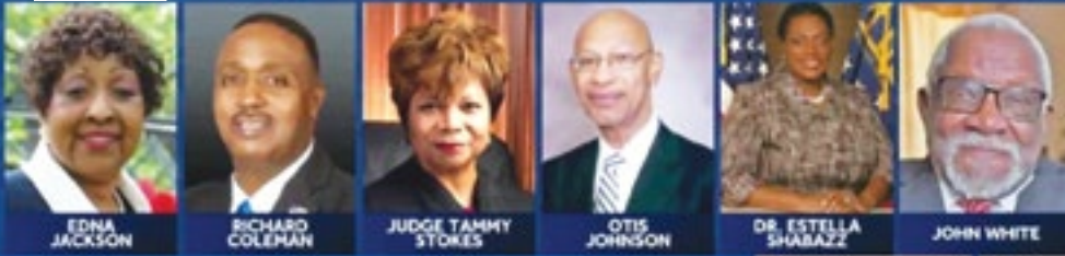
BLACK HISTORY PROGRAM HOUSING AUTHORITY OF SAVANNAH CELEBRATING LEADERSHIP, LEGACY