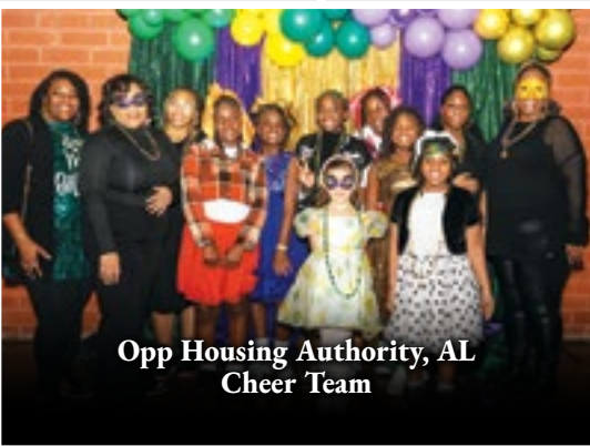
Opp Housing Authority, AL Cheer Team