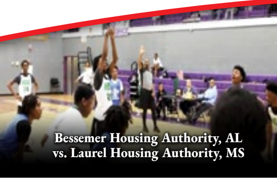
Bessemer Housing Authority, AL vs. Laurel Housing Authority, MS

Information on the upcoming 2027 SERC-NAHRO MLK Basketball and Cheer Tournament will be shared with the SERC membership as soon as it is available.