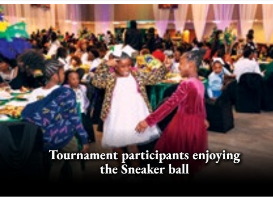
Tournament participants enjoying the Sneaker ball