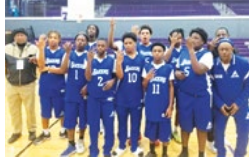
15 AND UNDER BASKETBALL: Alexander City Housing Authority, AL