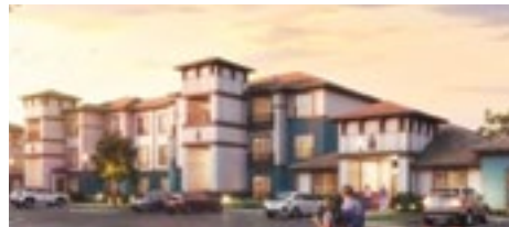
Rendering of Martin Manor.