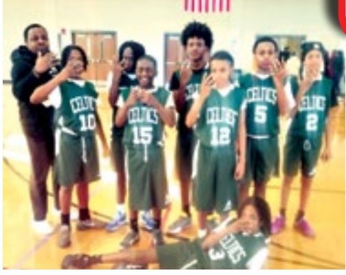
12 AND UNDER BASKETBALL: Alexander City Housing Authority, AL

2026 SERC MLK Basketball & Cheer Tournament Champions!