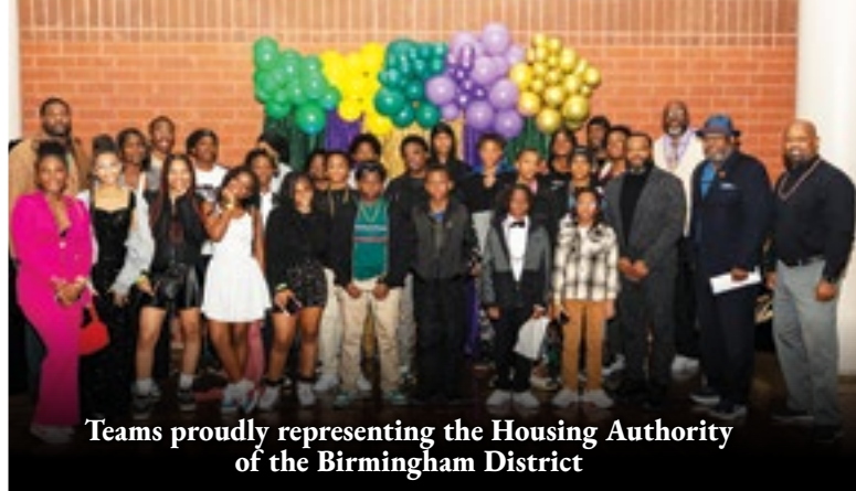
Teams proudly representing the Housing Authority of the Birmingham District