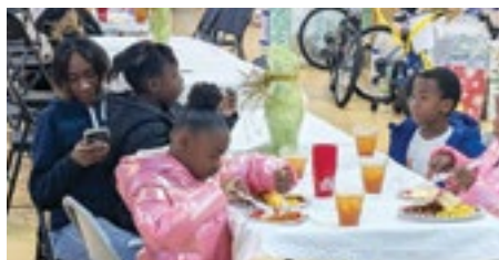
Youth from NHA enjoy their meal as they eagerly await receiving their gifts.

More than 100 families and seniors signed up to receive gifts through the Families Helping Families holiday assistance program, administered by the Palmetto Project in partnership with WIS-News 10. In addition, a generous anonymous donor sponsored the delicious meals for both events, which were prepared by Blessed by the Best Catering.