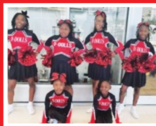
8 AND UNDER CHEERLEADING: Columbus Housing Authority, MS