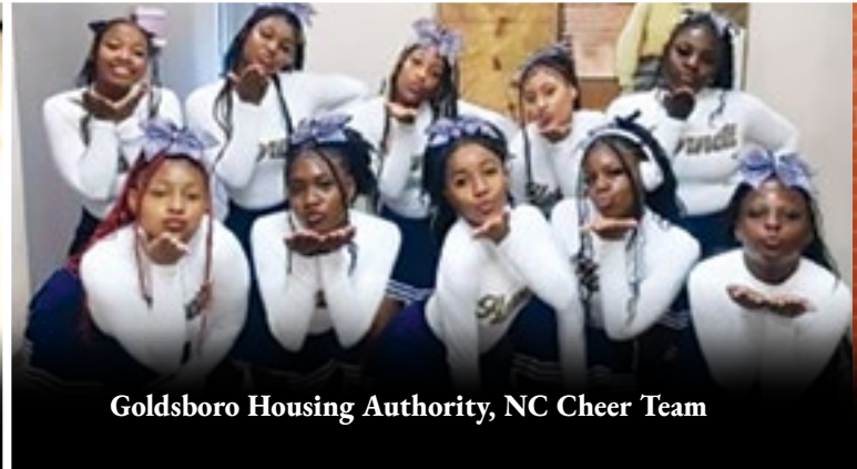
Goldsboro Housing Authority, NC Cheer Team