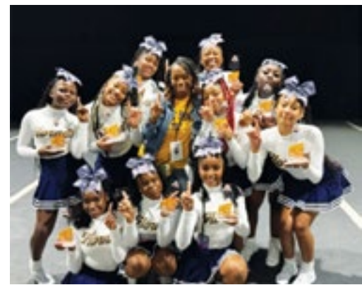
9 AND UP CHEERLEADING: Goldsboro Housing Authority, NC