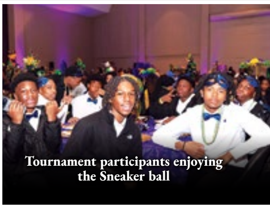
Tournament participants enjoying the Sneaker ball