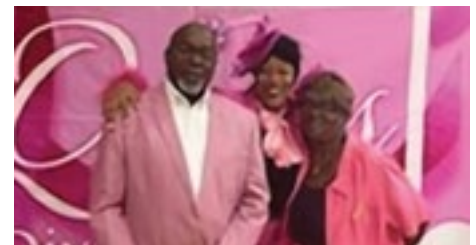
Individuals standing together in pink to support a meaningful cause.

Agency staff proudly participated in the first annual Inspired to Care Breast Cancer Awareness Walk hosted by Laurel High School HOSA. Staff dressed up and went out in their best pink outfits. The walk was a time of love and support, honoring survivors, those currently battling the disease, and those we have lost.