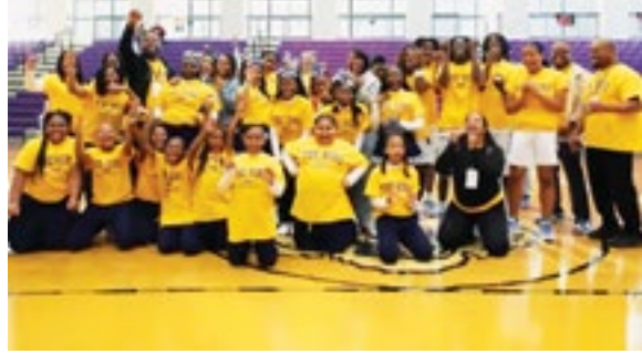
18 AND UNDER BASKETBALL: Goldsboro Housing Authority, NC