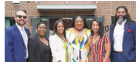
Officials and community partners gather during a celebration marking 90 years of service.

For 90 years, HABD has remained true to its mission of providing high-quality, affordable housing, fostering vibrant communities, and serving as a catalyst for opportunity for residents across the city.