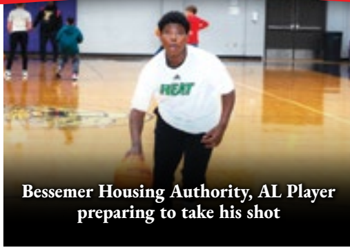
Bessemer Housing Authority, AL Player preparing to take his shot