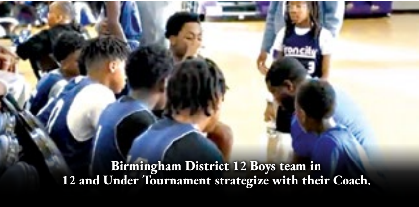
Birmingham District 12 Boys team in 12 and Under Tournament strategize with their Coach.